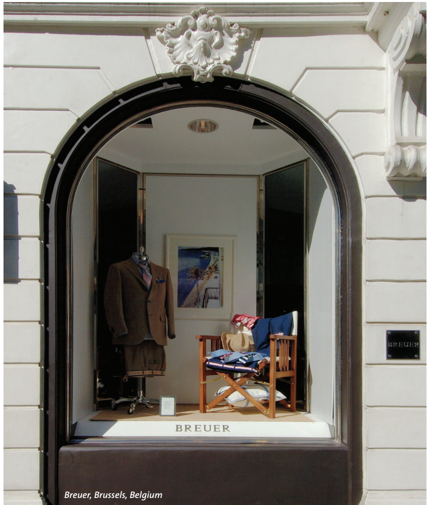
Breuer, Brussels, Belgium